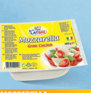
CODE 101100-8 units/crt.

CODE 110390 - 5 units/crt. EAN 8002612000340 EAN 8002612001965