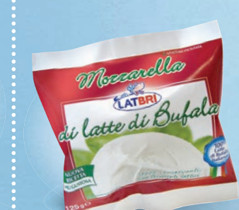
DI BUFALA 125a